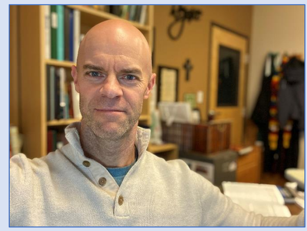
Pastor Candidate for PBPC